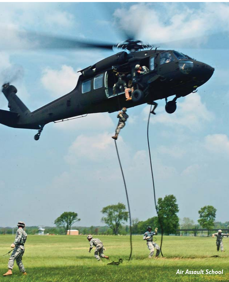
Air Assault School