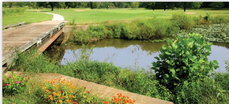
Pennyrile Forest State Resort Golf Course