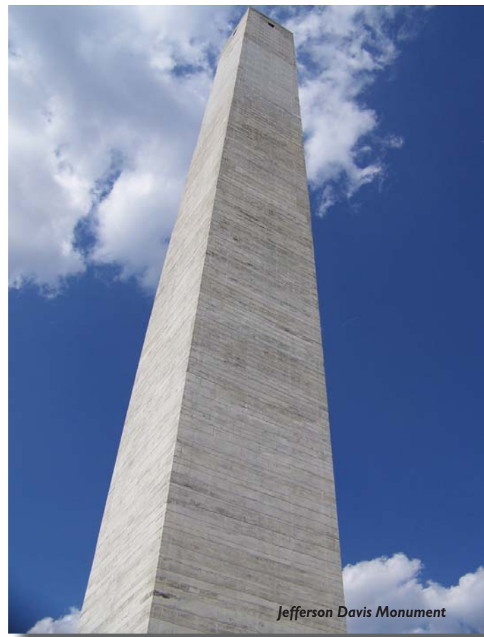
Jefferson Davis Monument

5817 Ft. Campbell Blvd., Hopkinsville, KY (270) 707-9653